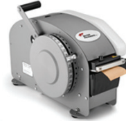
BP333 Plus with Heater