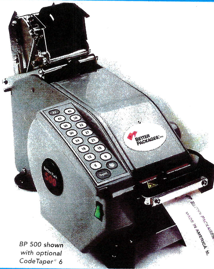
BP 500 shown with optional CodeTaper® 6

■ Also available for models Better Pack 556, Better Pack 554, Better Pack 400 with cradle. Counterboy 125, Counterboy 33A with cradle and Better Pack 333.